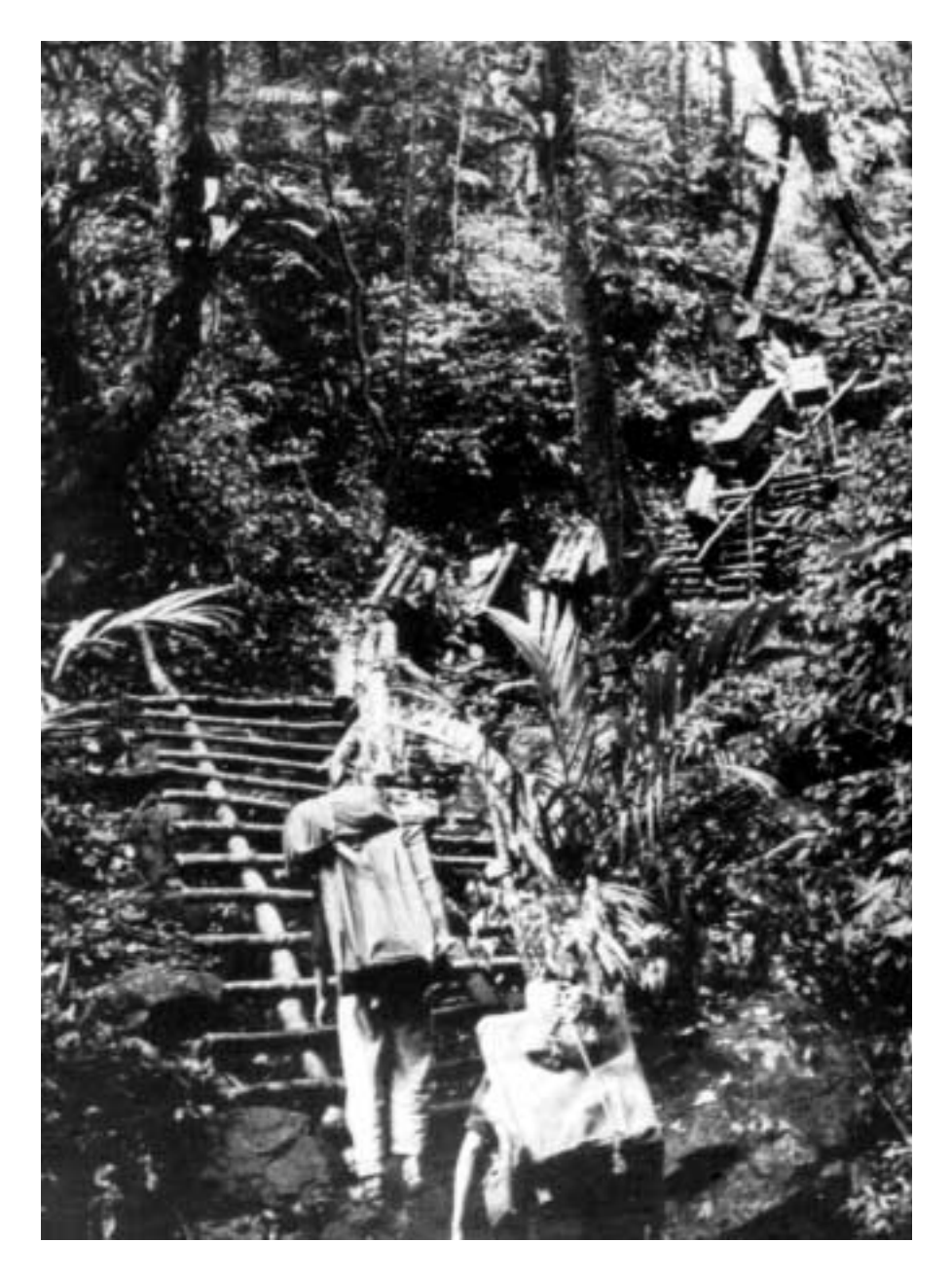
Porters Transporting Supplies

Porters are seen carrying supplies along one of the jungle footpaths that made up the Ho Chi Minh Trail.