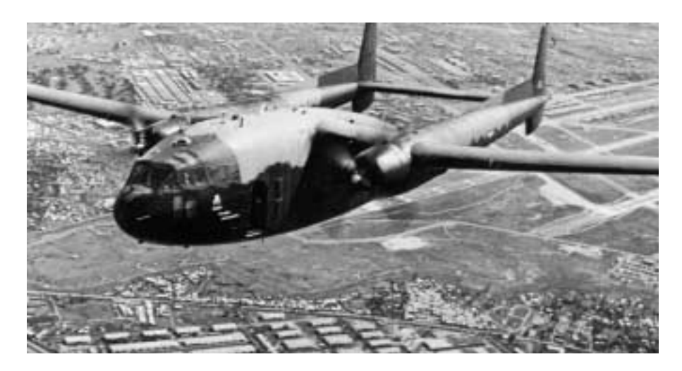
AC-119G over Tan Son Nhut Air Base, RVN

The gunship was a key weapon used to stop enemy infiltration along the Ho Chi Minh Trail.