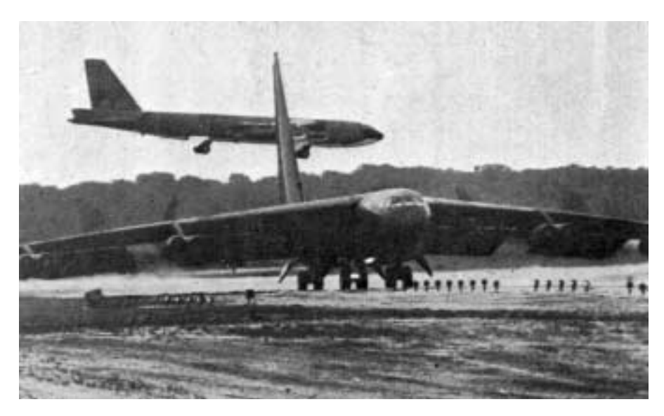
B-52D and B-52G

Arguably, the most significant B-52s in Vietnam were the D models. The Seattle plant built 101 Ds and the Wichita plant 69, the first flying on 4 June 1956. With US involvement in Vietnam growing by 1965, USAF officials initiated the $16-million "Hi-Density" or "Big Belly" modification program, which reconfigured Ds and provided the United States with the first bomber able to carry out massive strategic missions over the North, even though this would not occur for nearly seven years.