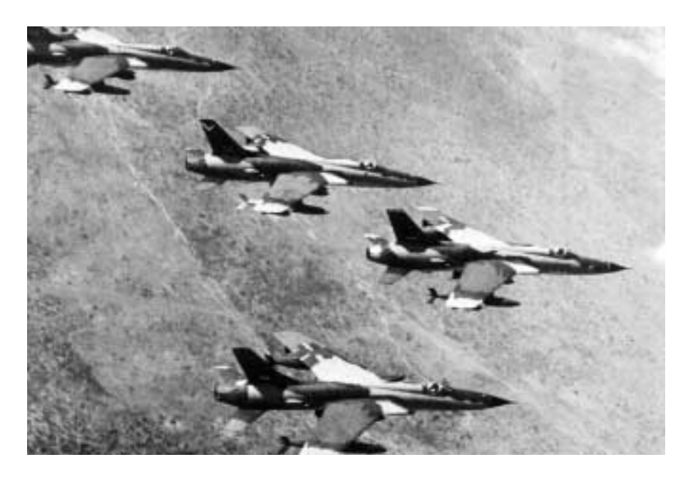
F-105 Thunderchiefs over Thailand

Thuds—such as these flying over Thailand—were used to bomb enemy bridges in the North and troop concentrations in the South during Rolling Thunder 1965–68. One specialized version was developed for defense suppression.