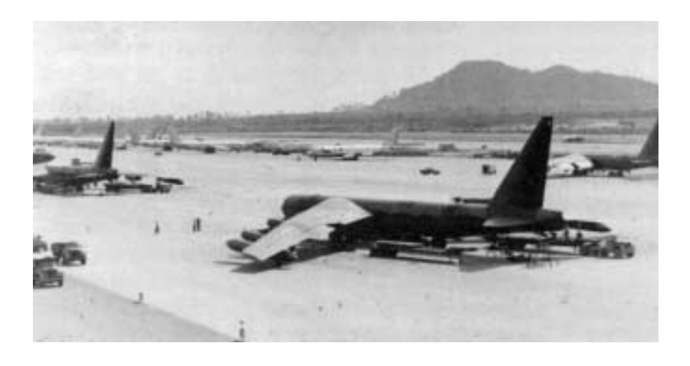
B-52Ds at U Tapao Royal Thai Air Base, Thailand

The USAF selected the Ds for modification for several important reasons. There were only 82 Fs, and they were running out of flying time. The Fs had no reserve capability and could barely fly the ever-increasing monthly sortic requirements of