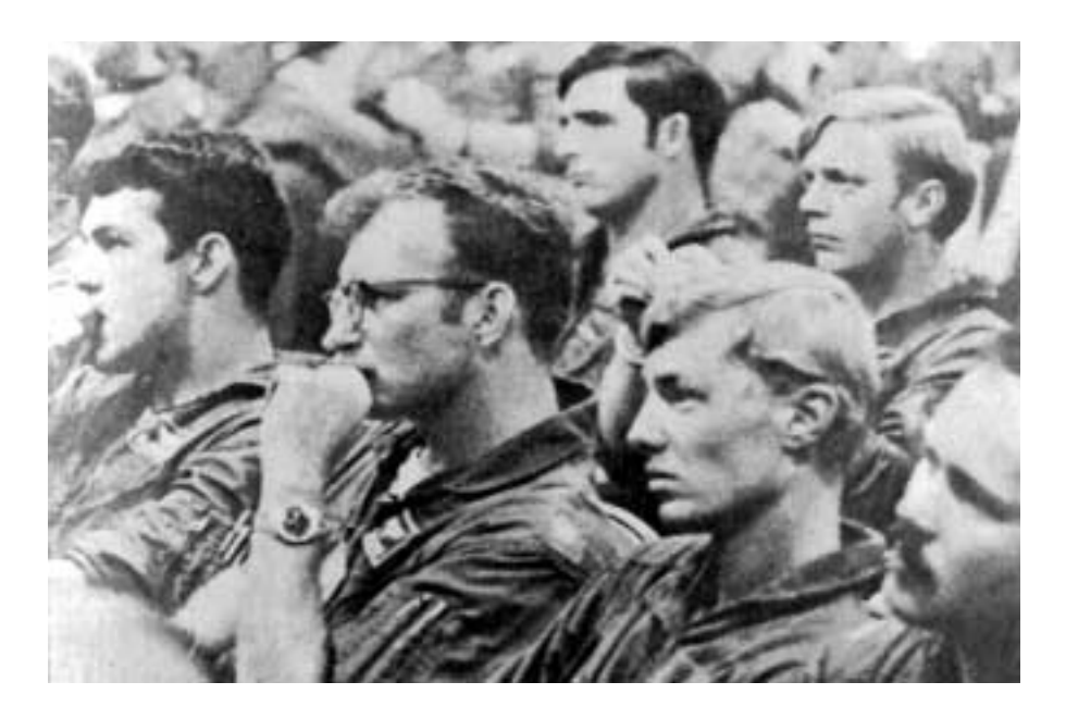
Crew Members in Linebacker II B-52 crew members during a briefing early in Linebacker II

familiar three-wave pattern. The targets were basically the same but this time the enemy SAMs downed six BUFFs and severely damaged another.<sup>217</sup>