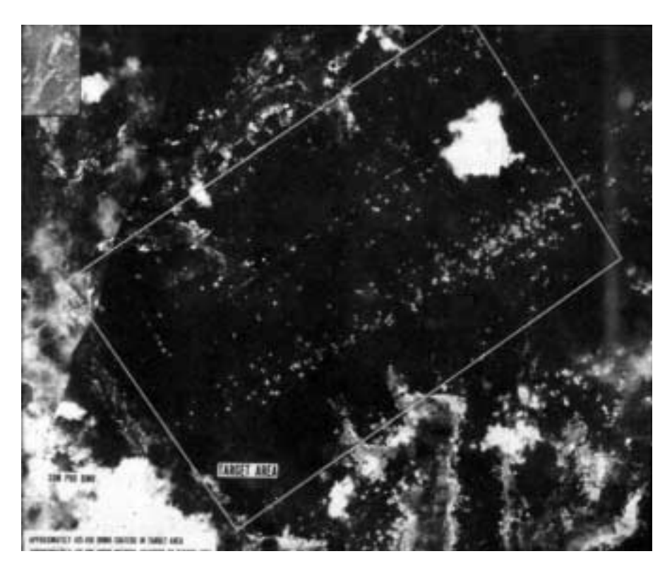
Arc Light Target Box after a Raid

Shortly after the raid, three US-led 36-man Army of the Republic of Vietnam (ARVN) reconnaissance teams inspected the area and found no enemy bodies and little damage to the camp area. Later, MACV discovered that the VC had fled on a tip from a spy in the local ARVN unit. The raid made news headlines