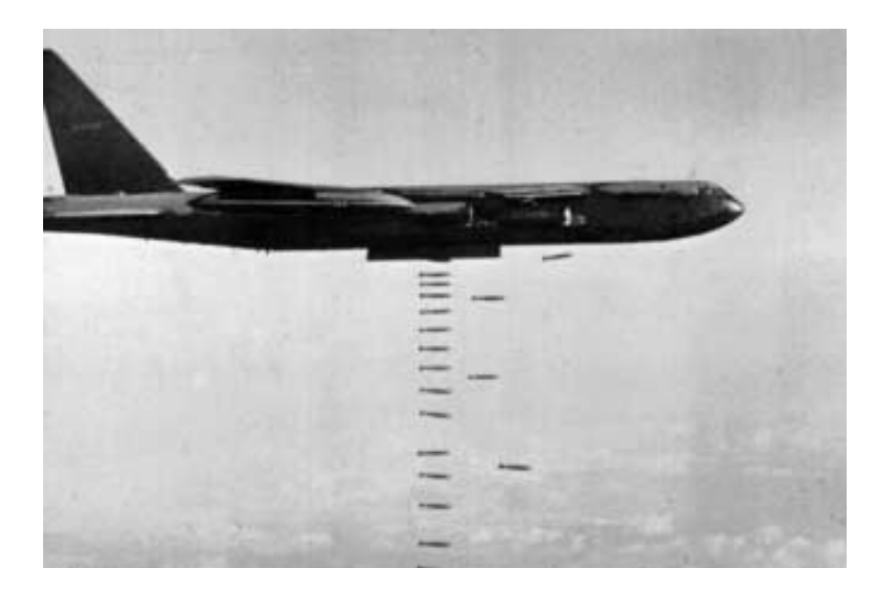
B-52D Dropping a Load on the Enemy

These definitions and their core components are not completely new. Following World War I, two airpower prophets—Douhet and Mitchell—wrote and spoke extensively on how airplanes should be used in war and how they would become the new primary military weapon. Douhet in The Command of the Air and Mitchell in Winged Defense and Our Air Force called on their nations to develop separate military air services and build vast armadas of bombers and fighters designed to take the war beyond the battlefront to the enemy's heartland. These theories—born out of a desire to avoid a repeat of the bloody and costly trench and ground combat of World War I—hypothesized