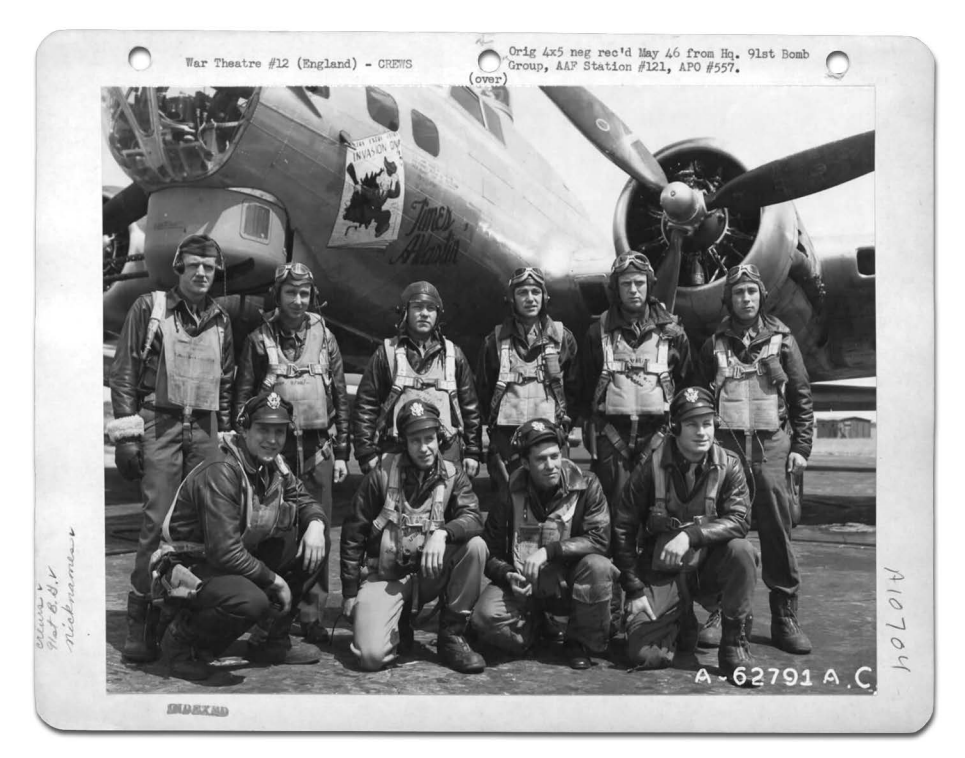
Figure 2. Crew of the 91st Bomb Group, 8th Air Force, beside their B-17 Flying Fortress<sup>104</sup>

104. Photograph of 91st Bomb Group crew, American Air Museum in Britain, object no. UPL 22448, n.d., https://www.americanairmuseum.com/.