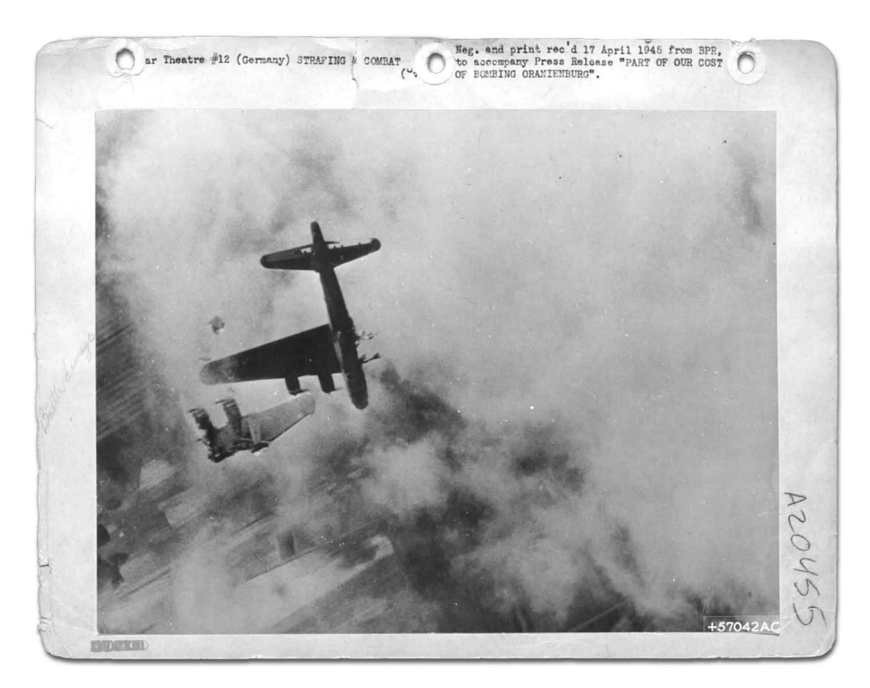
Figure 1. B-17 Flying Fortress falls from the sky in World War II

Increasing attention has been devoted to moral injury since 2001. While conventional warfare offers opportunities enough for moral injury to develop, counterinsurgency may provide even more because of the extent to which combatants may face increased moral dilemmas due to the sometimes more diffuse battlefield where civilian encounters can be fraught with tension, misunderstanding, and firepower.