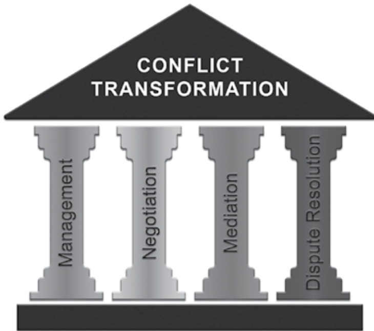
Figure 1. Conflict Transformation. The figure shows a military conflict transformation structure with conflict management, negotiation, mediation, and dispute resolution as substructures.

can lead to ill-informed choices regarding military operations. Where negotiation education is present in PME, it is principally as single lessons nested inside non-negotiation courses at various uncoordinated levels of instruction. Or, often it is offered as an elective which ends up having a limited impact across a curriculum—considering the restricted number of students able to enroll in classes. Stand-alone, in-depth, negotiation core courses are woefully absent throughout PME. Existing approaches to teaching negotiation in PME cannot be viewed as “good enough” when preparing leaders for the demands of modern military operations.