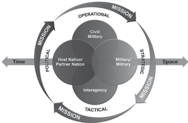
Figure 2. Military mission environment chart. The figure shows how civ-mil, mil-mil, IA, HNs, and PNs connect with military negotiation.

HN. The HN maintains its own unique political, economic, and cultural circumstances. The goal of military negotiators is to advance mutual gains.