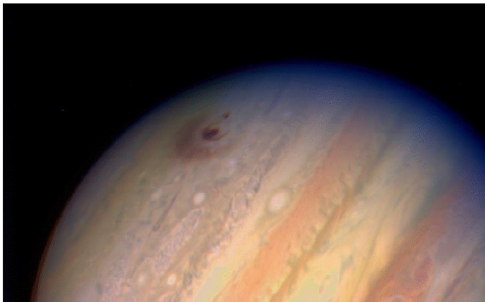
Figure 2 Shoemaker-Levy 9 "Fragment G" Strikes Jupiter, 18 July 1994 21

The press, and as a result Congress, were again energized to the NEO threat during 1994 when the spectacular Shoemaker-Levy 9 comet fragments hit Jupiter and were displayed in real-time on the internet and television. Hearings were held on Capitol Hill and determined congressmen again took bold action by commissioning yet another committee to recommend courses of action. Dr. Gene Shoemaker led the Near-Earth Object Study Working Group, whose product is today rightfully called the "Shoemaker Report." 20