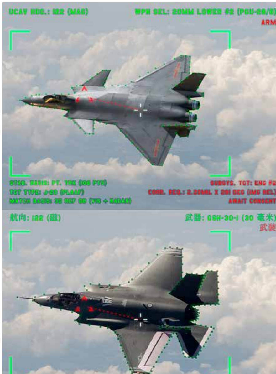
Figure 1. Dealer's choice: Mock-up graphics of computer vision for a sixth-generation approach. (USAF stock image of F-35A in flight and author's rendered image of J-20 using royalty-free 3D model purchased at TurboSquid, http://www.turbosquid.com/FullPreview/Index.cfm/ID/745460 . The author edited both images to illustrate basic object detection, recognition, and tracking principles inherent in the field of computer vision.)