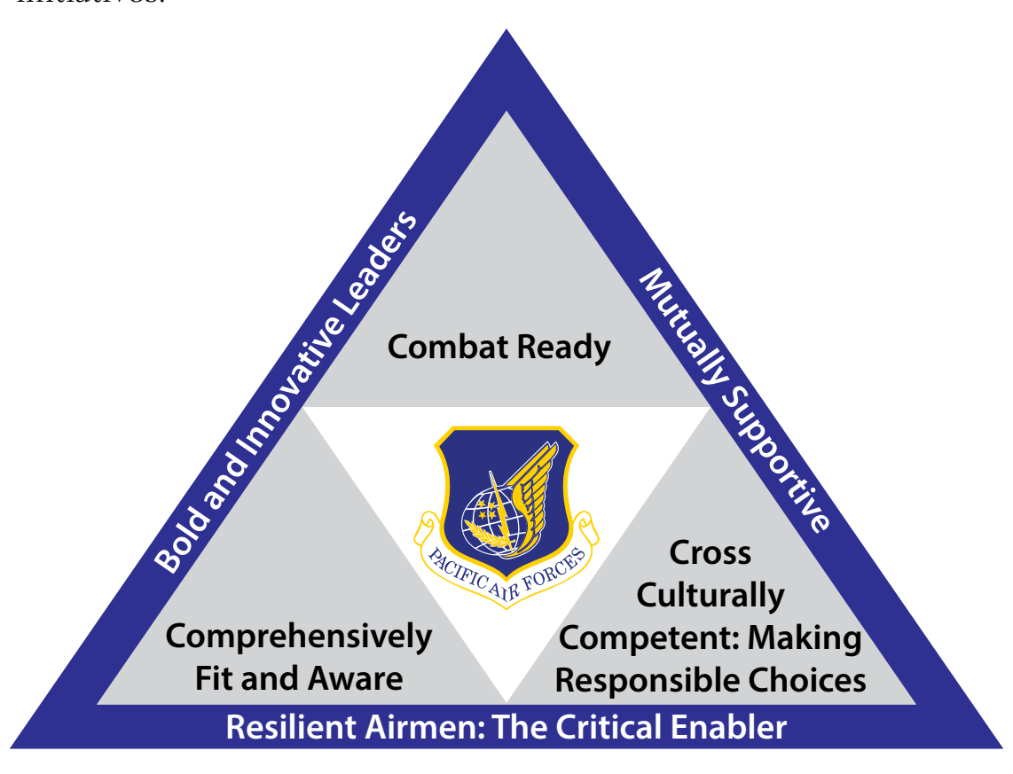
Figure. PACAF's model for resilient Airmen

RA strategy emphasizes three objectives: combat readiness, cross-cultural competence and commitment to making responsible choices, and comprehensive fitness and awareness. Using the RA road map, the RA OPG reaches these three strategic objectives through a number of initiatives.