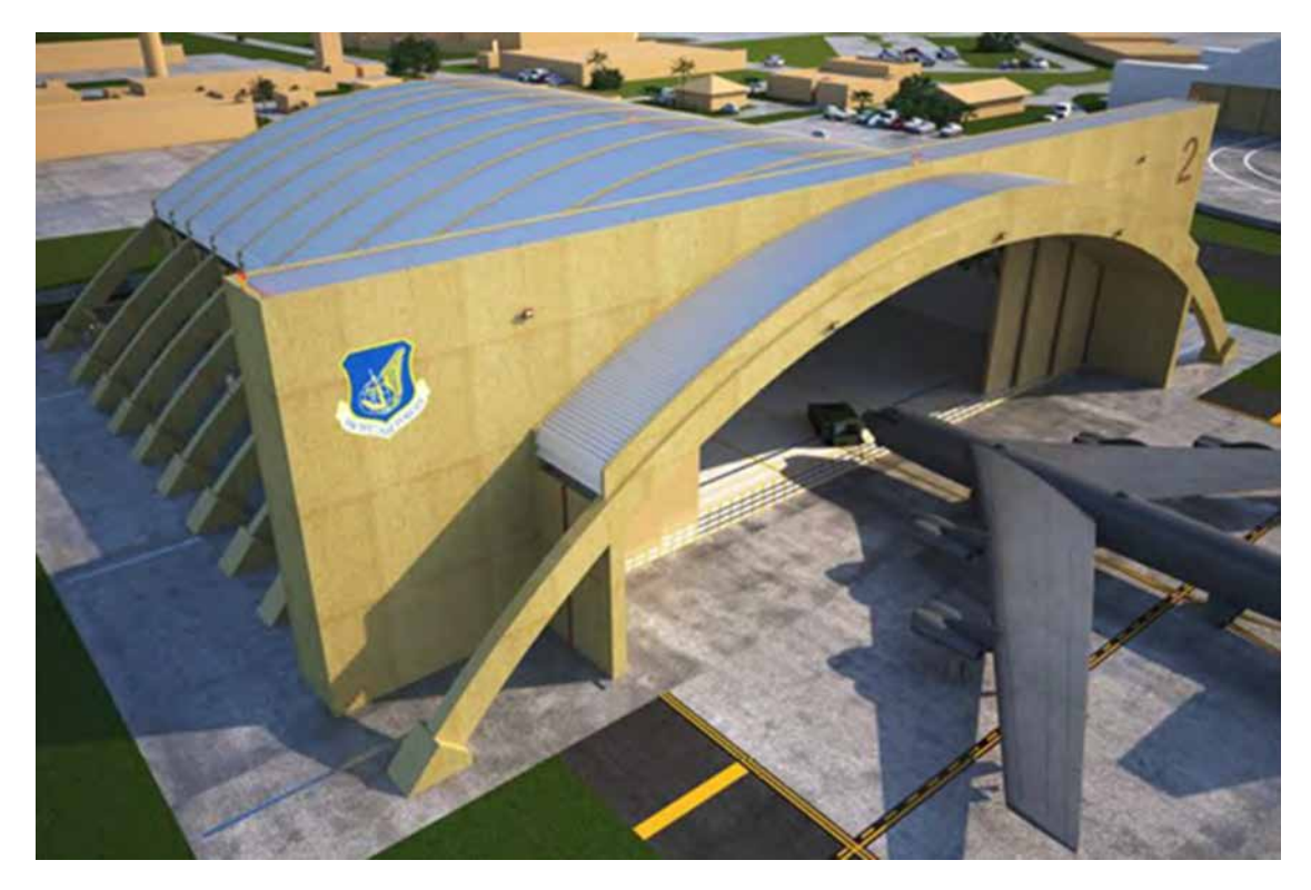
Figure. Hangar with HIPPO technology scheduled for construction at Andersen AFB, Guam. (From briefing, US Air Force Civil Engineering Command, subject: HIPPO JCTB, 10 September 2013.)

PACAF is implementing a dispersed basing strategy—pioneered in the Cold War but applicable today—to reduce the vulnerability of aircraft at bases within range of adversary missile systems. PACAF is investing significant resources into several forward locations. Furthermore, it is dusting off lessons learned from World War II and the Cold War to resurrect the ability to "flush-launch" (rapid engine start, taxi, and takeoff) alert aircraft upon receipt of warnings of tactical inbound missiles and continue to generate combat airpower despite missile attacks. Cope Sumo, PACAF's new resiliency exercise concept, is based upon the successful Salty Demo exercise held in Germany (US Air Forces in Europe) in 1985. Cope Sumo will test our ability to rapidly disperse, flush, and recover aircraft within the theater.