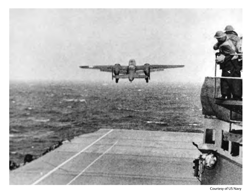
Figure 4. Aircraft no. 1, flown by Lt Col James A. Doolittle, right after its takeoff from the deck of the USS Hornet on the morning of 18 April 1942