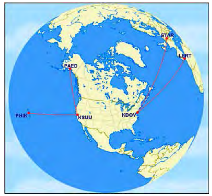
Figure 1. Strategic city pairs analyzed using the ASM