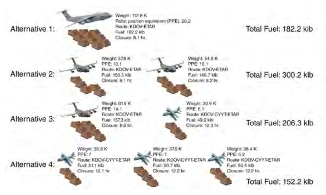
Figure 2. Aircraft mix alternative, KDOV-ETAR, 8 July 2012