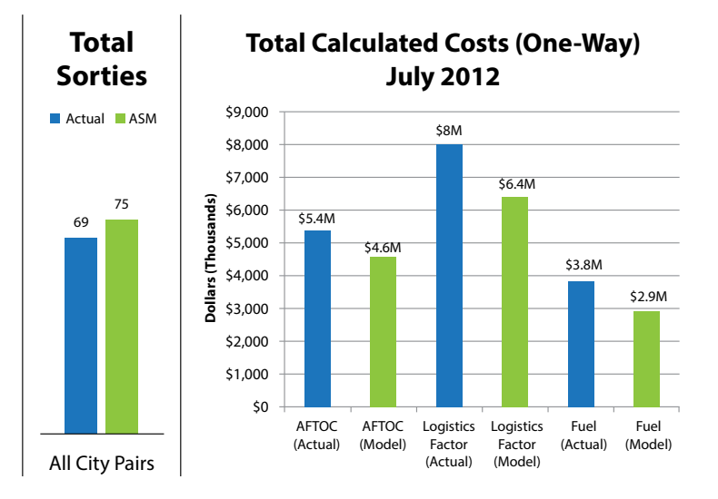
Figure 3. Actual versus ASM cost metric comparison

This method was repeated for each day and each city pair during the July month of analysis with the following results (fig. 3):