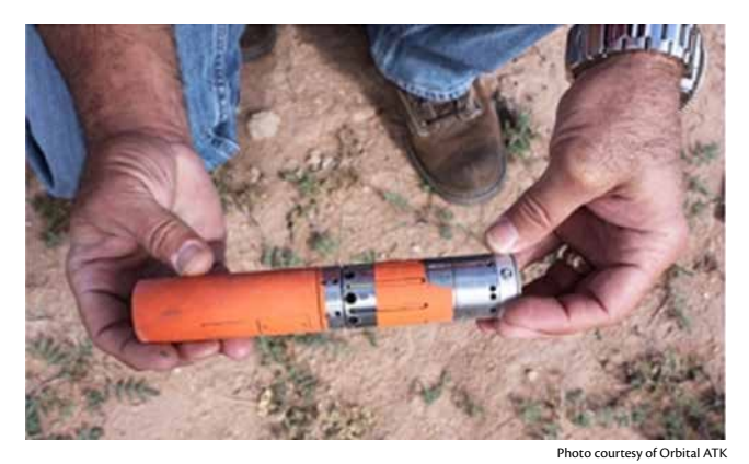
Figure 3. Orbital ATK's HAPS kill vehicle

Another USN program, Standoff Weapon Defeat (SOWD), which has similar RPG defeat concepts as the HARP program, touts being "useful as a drone countermeasure."<sup>49</sup> Users and investors in SOWD range from DARPA to the Secret Service, and over 10 Army agencies are involved in the program. However, only one USAF agency—the Air Force Security Forces Center—is involved in SOWD support.<sup>50</sup> This disparity is understandable based on the current base-defense-doctrine construct placing the majority of base kinetic defenses under an Army lead. But the USAF has to consider the utility of SOWD not only for air base defense but also for air-to-air engagements.<sup>51</sup> Further, as threats loom for flight departure and recovery corridors, the Air Force might have more of a doctrinal interest in those area defenses than does the Army, inviting application of more USAF resources.