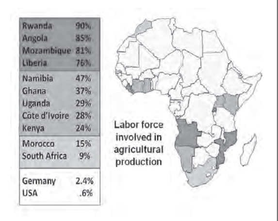
Figure 1. Subsistence agriculture in Africa. (Data from US Central Intelligence Agency, CIA World Factbook , https://www.cia.gov/library/publications/the-world -factbook/index.html [accessed 24 February 2010].)

tence to the production of excess commodities that can be marketed or bartered. But, for a majority of Africans, agriculture is production for pure survival. Conflict over resources has effects that extend beyond the particular conflict, which may result in the degradation of those resources and may limit access to arable land or fish habitats. The needs of survival then foster further conflict—or, as often, make starving or displaced populations vulnerable to oppression and manipulation.