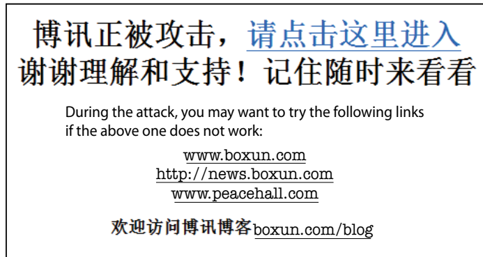
Figure 3. Screen capture from Boxun.com announcing the attack and directing visitors to a temporary website.

Intimidation. On 19 February 2011, at least 15 prominent activists and lawyers were detained prior to the start of announced street protests. 14 Authorities invited some of them to “chat” or “drink tea” (online slang for forced interrogation), detaining and forcing additional activists to do the same over the next few months. 15 Stoney Wang, a blogger from Shanghai, offers his account of one of these interrogations: