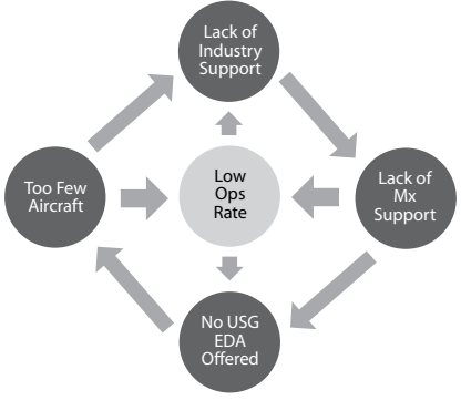
Figure 1. Low operations rate

Expounding on the root causes of each of these shortcomings, maintenance and fleet size, reveals that they are inherently connected. In fact, one does not have to look farther than the mechanisms available to a poor nation to acquire more aircraft, particularly through US EDA programs. The USG, generally speaking and rightfully so, prefers a nation to be capable of supporting their aircraft mechanically before they are granted more. Additionally, the USG desires to see concrete, measurable results from those nations in alignment with USG interests. When a country does not possess enough aircraft to warrant such results, because they do not possess the maintenance capacity to operate a larger fleet, these results are difficult to achieve. Therefore, the USG will not want to provide EDA aircraft in what is an extremely competitive process. Absent a large enough fleet to warrant it, private enterprises capable of conducting high-level maintenance will not want to invest in a depot level facility on the continent, which is the only way maintenance practices will increase, and the only way the USG will be willing to provide more aircraft. Until regional, governmental partners with similar interests unite contractually with one another, as well as industry capable of conducting high-level maintenance, the cycle will not be broken, and air mobility in sub-Saharan Africa will remain elusive.