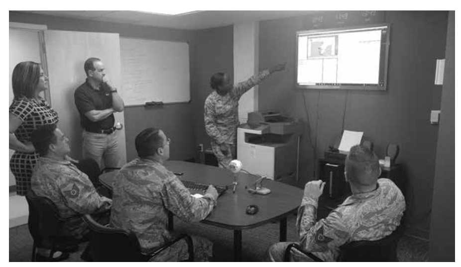
The Network Control Station and SPS staff conducting a communications exercise, using the SAVICO.

Another date which is of importance where the new approach of the SICOFAA directly affects the SITFAA was the unfortunate earthquake in Ecuador in April 2016. During the mentioned event the network control SITFAA handled an enormous amount of information of the time, which made difficult their timely dissemination system, basically that information would be handled point to point, reason which arises theneed to implement a tool capable of providing information in a centralized way and in real time for all the members of the SICOFAA.