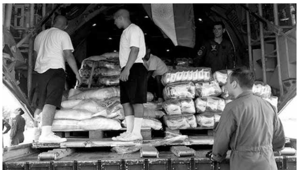
Source. Peru INFORMA.com: Hercules of the Argentina air force in humanitarian aid operations in Chiclayo, Peru, by the floods of March 2017.

To be able to develop their activities, keeping the new approach in mind, currently the SICO-FAA carries out its cycles according to the agreement reached in the LIII CONJEFAMER, held in Santiago de Chile in June of 2013, where the SPS as part of the presentation of the Master Plan for 2012-2017 of the SICOFAA, proposes "exercise cooperation with each two-year interval being the other real and virtual one", considering the third year for subjects of common interest to its members (thematic cycle).