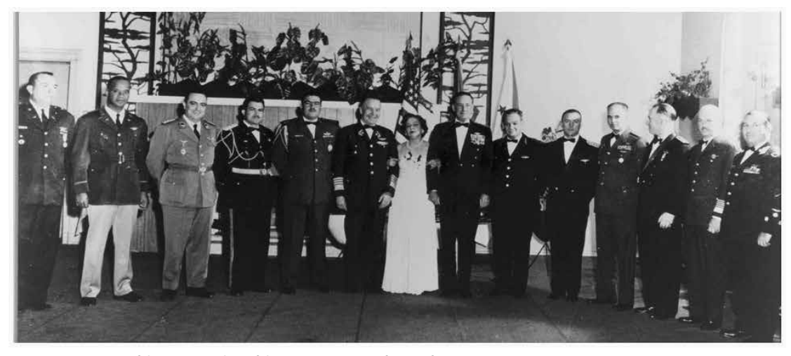
Picture of the commanders of the participating air forces of CONJEFAMER I.

On 16 April each year the system of cooperation among the American air forces (SICOFAA) celebrates the day of its creation, in commemoration of the first Conference of Chiefs of air forces of America (CONJEFAMER), 57 years ago, held from 16 to 25 April 1961 at Randolph Air Force Base, Texas. Its purpose was to promote greater understanding and cooperation between the air forces of the Americas with a view towards hemispheric security , as enshrined in the first worksheet of the workbook of SICOFA Permanent Secretariat's register.