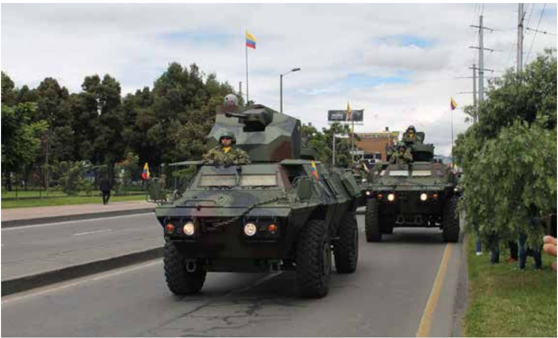
National prototype of the ASV M-1117 with a special armored turret, with a 20 mm. cannon and a FLIR device. The Cavalry would like to increase the firepower of the M-1117.

This specialty is very advanced in Colombia, not only because of its doctrine, but also because of its capabilities and the ownership of sophisticated equipment for surveillance, interception, and control. They usually work closely with personnel from Communications and Army Aviation, while others gather SIGINT and IMINT. Military Intelligence integrates and interprets the data, complementing it with the HUMINT information it has been able to gather. The greatest recent operational successes are due to this specialty.