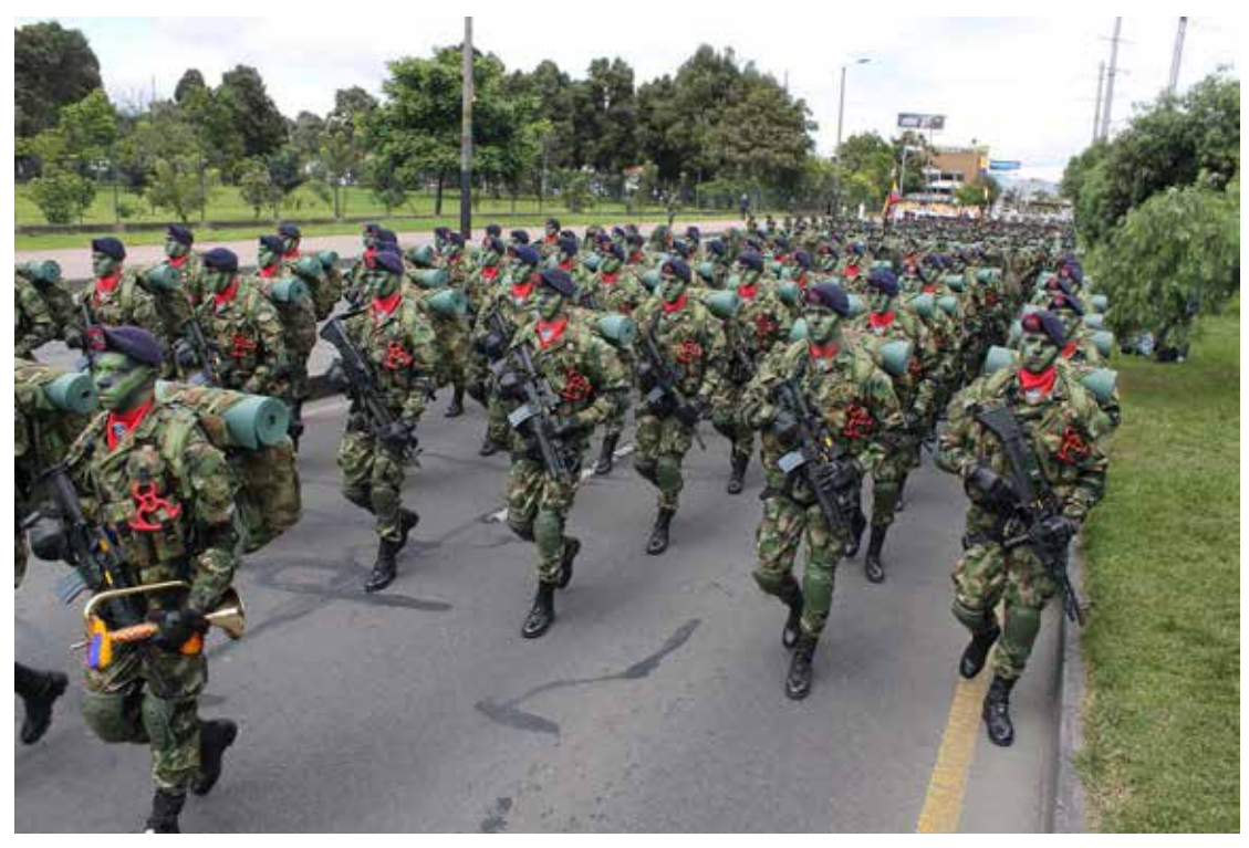
Soldiers from the Special Brigade against Drug Trafficking. This unit provides supports in eliminating illegal crops in different regions of the country. In some places drug traffickers present armed resistance, therefore, it is necessary for troops to arrive before this happens and guarantee the safety of the eradicators. This brigade operates completely by air and its troops are equipped with the most modern equipment and weapons.

or 50 years the Military and Police forces, representing the national government and democratic institutions, had to confront the FARC's subversive threat. This conflict left 200 thousand dead and more than six million internally displaced persons. After a complex process of negotiations, the President of the Republic, Juan Manuel Santos, an economist, was able to accomplish a peace agreement with the FARC which led to its demobilization, disarmament and reintegration to society. To date, the FARC has formed as a political party, which will participate in the upcoming elections.