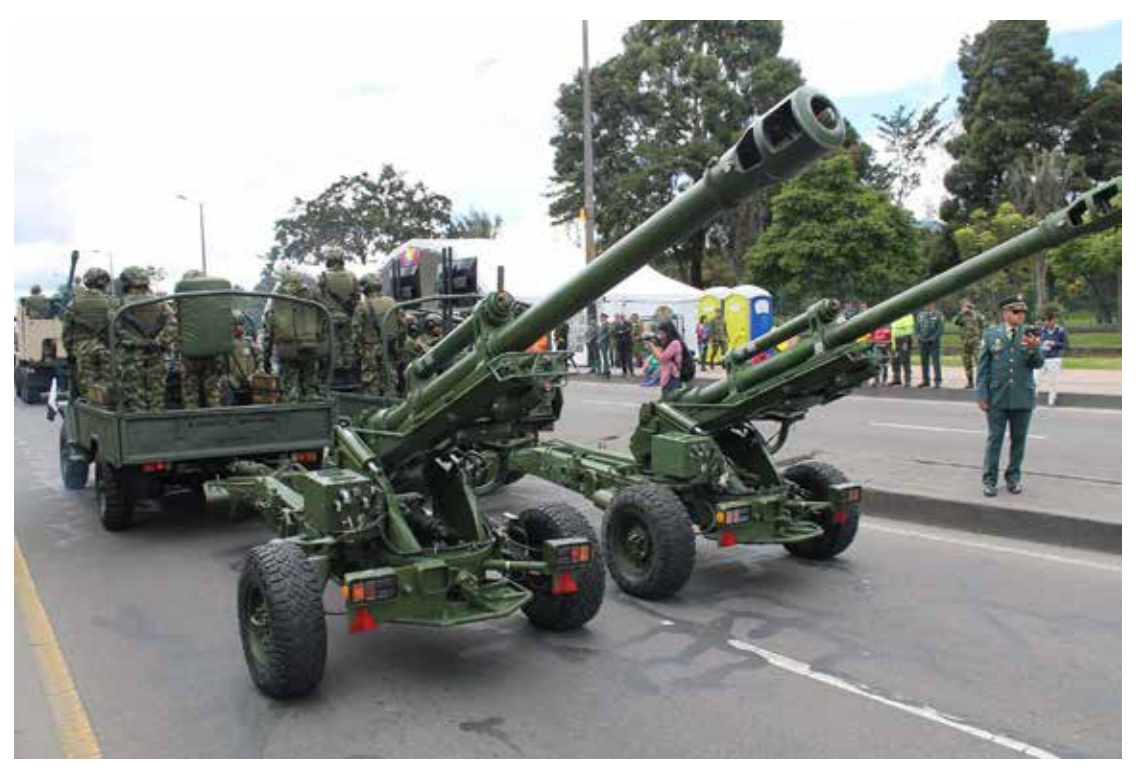
LG-1 105 mm. howitzer, being towed by M-462 Abir vehicles. The Artillery Batteries with these weapons have modern systems of firing control, data links and target acquisition. However, they are considered extremely light and the crew is unprotected when facing counter fire, therefore Colombia needs self-propelled artillery weapons.