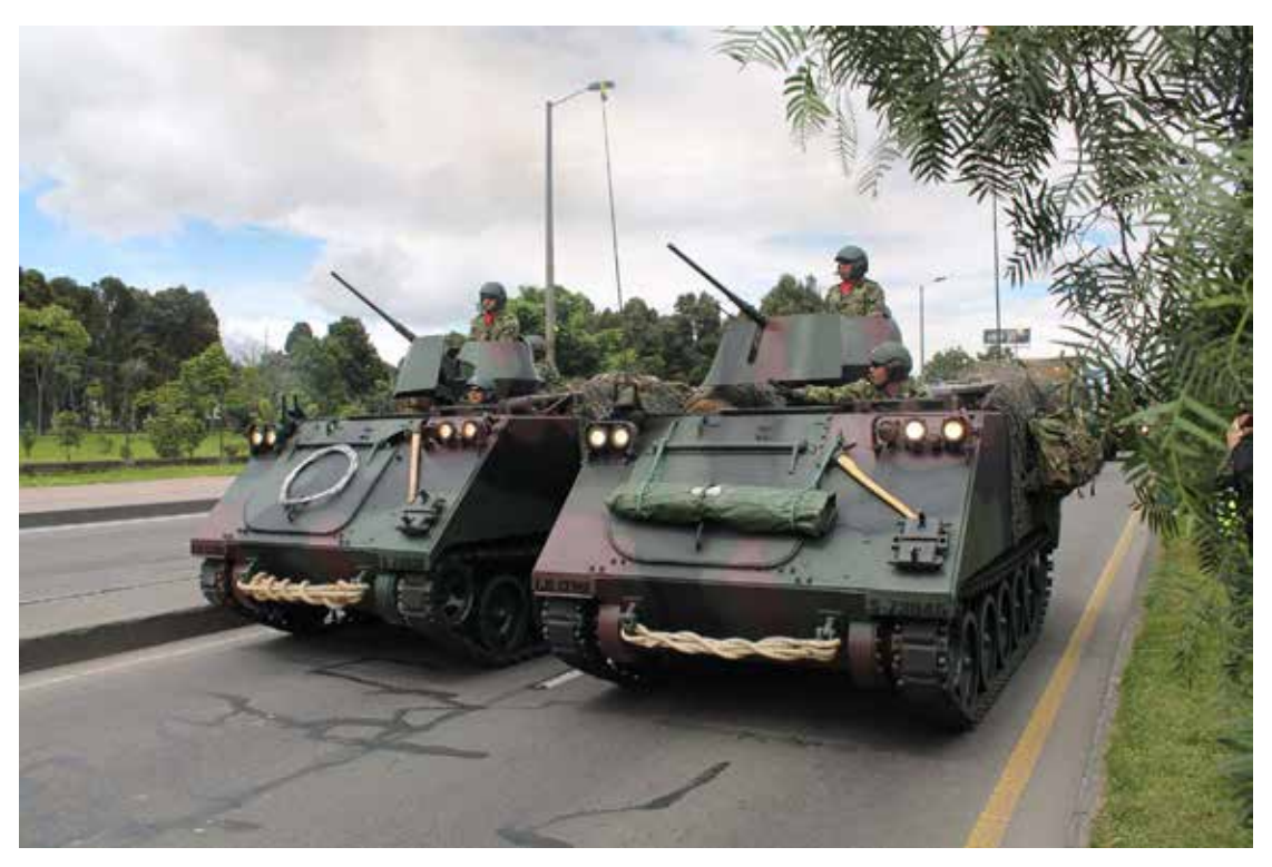
M-113A2+ of the Colombian Army. From the image you can see they are in perfect condition. These vehicles are with the Mechanized Infantry in the northern part of the country. The modernizations made them lose their amphibious capability. The only armored amphibious vehicles that the Colombian Army now owns are the EE-11 Urutú.

While the Colombian Army's Special Forces have been in existence for various decades, it was not until 2017 that they were assigned as an independent specialty, in which someone can make a career. This legal aspect was also accompanied by a restructuring of the units, which made posible the Special Forces Division.