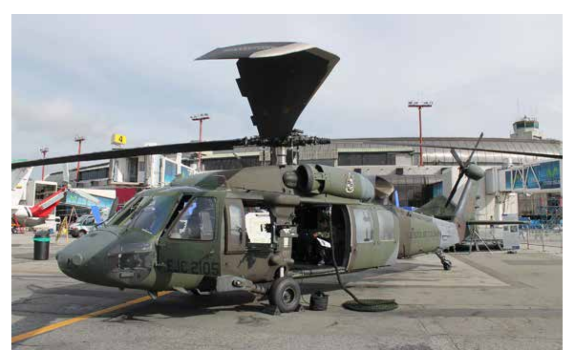
The most modern aircraft in Colombia's Army Aviation is the S-70i. It has the most advanced electronics for navigation and self-testing. Aircraft like these allow the Colombia Army to develop its capabilities for air assault.

On the other hand, the Colombian Ministry of Defense is trying to strengthen the nation's military Industry and is open to negotiations which include the incorporation of new technologies, establishing commercial alliances, strategic associations and, in general, any agreement that prompts national companies in the defense sector and allows them to become important actors in the international arena. \Box