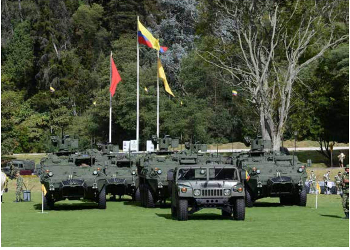
Mechanized Infantry Unit of the Colombian Army made up of five 8x8 LAV-III y one HMMWV. The LAV-III is equipped with an automatic turret, Rafael, of Israeli manufacture, "Remote Controlled Weapon Station" (RCWS) Samson Mini, with a .50 caliber (12,7 mm) weapon.

Has eight Divisions with jurisdiction over all the national territory, with the exception of coastal municipalities and islands, for which the Marines are responsible. There is also an Aviation Division which includes all the aircraft and helicopters used by the Army, and a Division made up of a group of Battalions of military specialties such as Infantry, Cavalry, Artillery, etc.