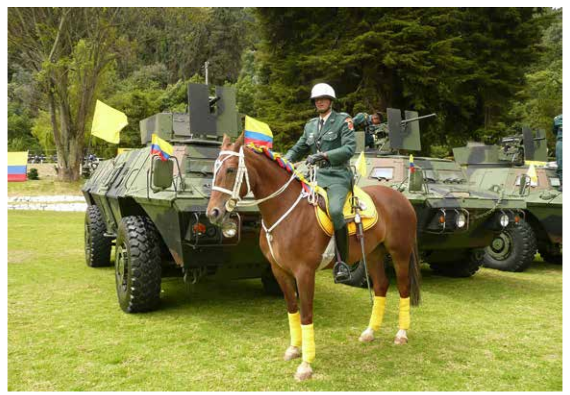
The modern and the traditional. In the picture a Cavalry officer on horseback facing the modern Colombian Cavalry's ASV M-1117. This picture was taken at the Cavalry School (ESCAB) in Bogota. Next to it is the Army's Equestrian School, where they take pride in maintaining the traditions.

The maintenance battalion (BAMAN) is assembling Bufalo armored vehicles, based on the HMMWV, in which an armored capsule is installed to protect the crew. These vehicles transport support weapons in a pedestal located on the top part.