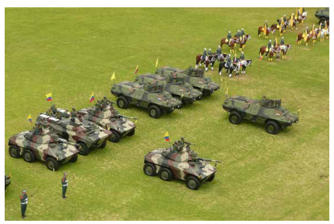
Aerial picture that shows three platoons of the Colombian Cavalry, the first one is made up of Brazilian vehicles, Cascavel and Urutú, the second one by US ASV M-1117, and the third platoon is a mounted Cavalry.

One of the versions of the Cobra vehicle, mentioned above, is equipped with ground-ground 70 mm. rocket launchers. It has been successfully tested and the Colombian Army is contemplating ordering some units.