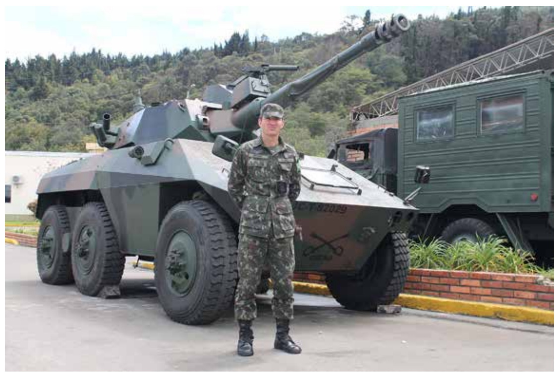
The EE-9 Cascavel, is the main combat vehicle of the Colombian Army. It is generally kept in good condition and has the support of the Brazilian Army for instruction and training. In the photograph, there is a non-commissioned officer from the Brazilian Army who worked as instructor at the Colombian Army's Cavalry School (ESCAB).

The mechanized infantry is equipped with tracked armored vehicles M-113A2+, and wheeled vehicles 8x8 LAV-III. They are supported by TOW anti-tank missile launchers mounted on armored HMMWV. The Army owns various versions of M-35 tactical trucks, however, the greatest amount of trucks used are of civilian origin of various brands and models. In addition, they are painted in bright colors, to confuse rebels and terrorists who would not know the trucks were transporting troops until it was too late. It is foreseeable that now that the Army wishes to increase deterrence capabilities, the ratio between civilian trucks and tactical trucks might be inverted.