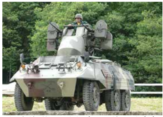
This model is an M8 Greyhound equipped with a Maxon anti-aircraft turret with capacity for four 12.7 mm (.50) M2HB. The Colombian Army kept them in service until recently, as anti-aircraft support for mechanized units. They have already been retired from the service, but some are in reserve. The Colombian Military Forces lack good anti-aircraft systems. This is one of its most pressing needs for the future.