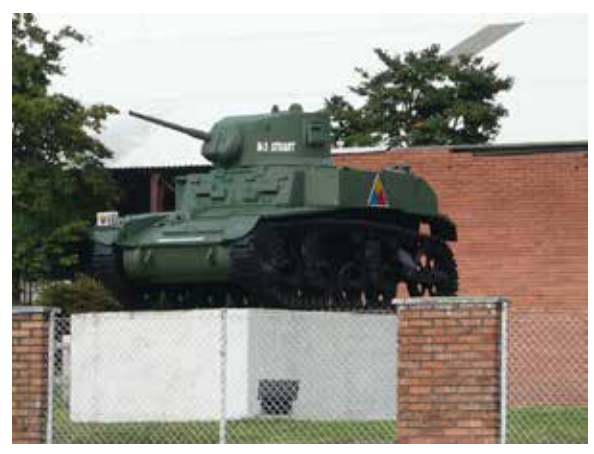
The M-3 Stuart, US manufacture, is the only tank (light) that the Colombian Army has owned in all its history. The 12 units purchased at the end of WWII, were assigned to the Colombian Cavalry for various decades. Today, they have been retired and assigned as "Gate Guards" in some units. Soon, they Colombian Army hopes to acquire a modern war tank (MBT).

Accompanying weapons are made up of light machine guns, 5.56 y 7.62 mm.; multiple grenade launchers, 40 mm.; command-type mortars (no tripod or base plate), 60 mm.; precision rifles, 7,62 mm. and light antitank rocket launchers. The Ministry of Defense, through its Social and Business Group (GSED), interested in boosting the capabilities of the military industry, chose some weapons and negotiated their manufacture in Colombia. INDUMIL, a Colombian company, is manufacturing the Negev machine gun of Israeli origin, the grenade launcher MGL, from Milkor a South African company, a nationally manufactured mortar, and versions of the Galil precisions rifles from the Israeli IWI. INDUMIL is in the process of investigating and developing rocket systems, which will eventually allow, among other things, the manufacture of antitank rockets.