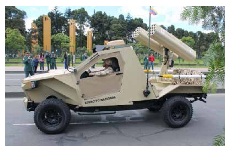
Cobra is a vehicle designed and manufactured nationally, this a multiple rocket launcher 70 mm. version. This version has been widely tested and has given excellent results. We hope the Colombian Army purchases them to equip artillery units.