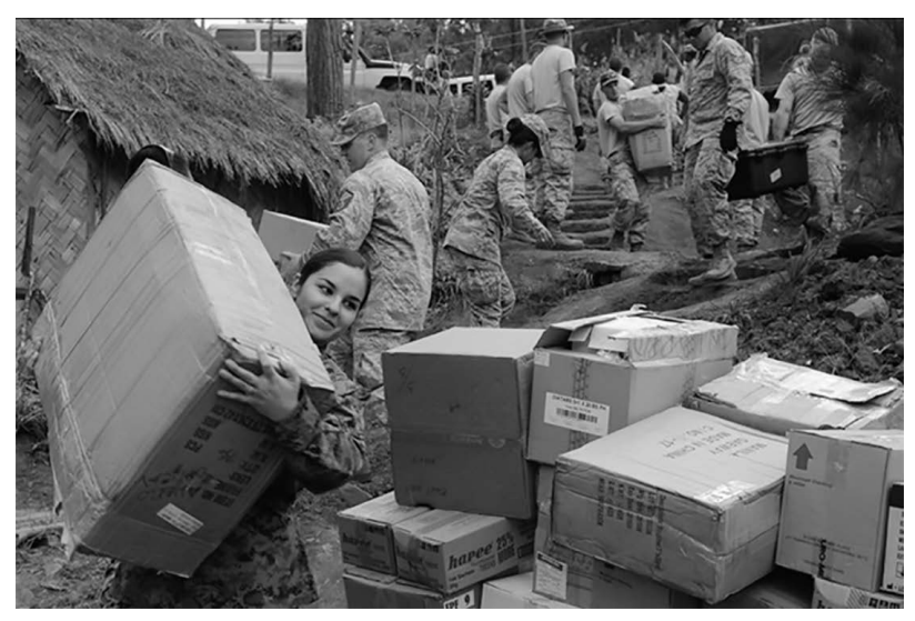
Figure 6. Operation Pacific Angel participants help improve Papua New Guinean school.

the interaction with you (IC) or spending time with others who are preoccupied, withdrawn, and cold to you, clearly focused elsewhere. Which treatment do you prefer? Similarly, the act of learning to behave ethically requires our entire humanity, not merely our intellect. Logical thinking alone is not sufficient grounds. If the use of intellect, of our reasoning capacity, alone were enough to guide us to a foundation of ethical soundness, it is worth reflecting that prior to the rise of the Nazis, the democratic Weimar government of Germany headed the most literate country in Europe. 185 In 1920, 12 years before the Nazi Party's democratically elected rise to power, highly respected German professionals Judge Karl Binding and medical doctor Alfred Hoche, of their own volition, wrote and published their rationally conceived booklet On Permitting the Destruction of Life Unworthy of Life. 186 From philosophy, we can get a clearer handle on the term "humanity." Plato viewed the whole human person in terms of his famous tripartite concept: