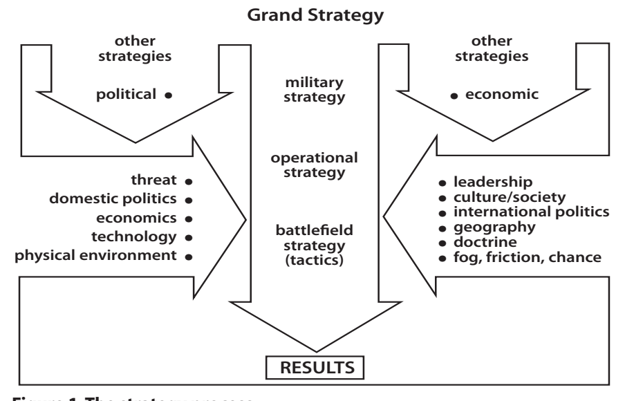
Figure 1. The strategy process