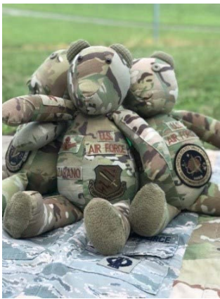
Figure 1. Teddies by "Quilts and Crochet by Jonna" on Facebook