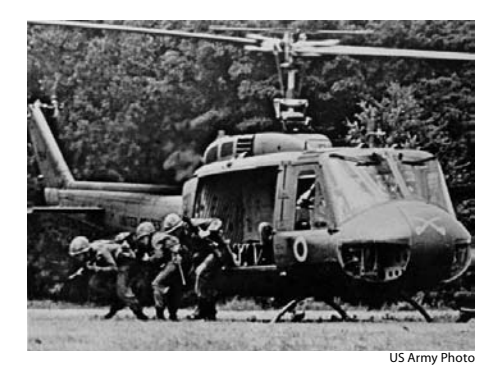
Figure 4. Army UH-1 Huey airlifting troops in Vietnam.

Rucker, Alabama very early. They built their ideas around the helicopters that came on strong after 1947, and amply demonstrated their utility in medical evacuation in Korea. When the principals of the unification trauma of 1947 had passed from the scene, the helicopters were applied to a wider variety of missions like tactical airlift and CAS (though another name was