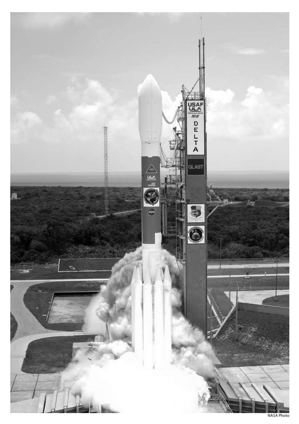
Figure 5. Atlas Launch. Early models of the rocket carried the Mercury astronauts into space.