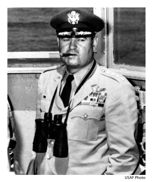
Figure 11. Gen Curtis LeMay, one of the grandfathers of Global Strike.

All admit that military force does not answer all problems, but the longrange strike of the USAF is unmatched and has both visible and invisible effects-Global Power: Whatever the limitations of global strike, it is worth remembering that the major goals in World War II were to stamp out German and Japanese militarism. Since 1945, no two developed powers have been more given to pacifism than Japan and Germany. Deterrence is hard to prove because it involves inaction on the part of a potential adversary. But despite several serious international crises.