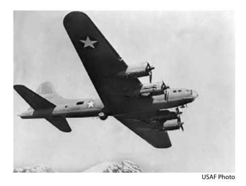
Figure 6. B-17F, a pillar of the daylight strategic attack on Germany.

tion of the bombing and the submarine blockade if it had not been for the nuclear attacks and the Soviet intervention. Those were the only two nuclear strikes and have not been repeated for more than a half century. In any event, the mission is now shared with the Navy who can perhaps do it better because of the mobility and stealth of the missile submarines, a superior foundation