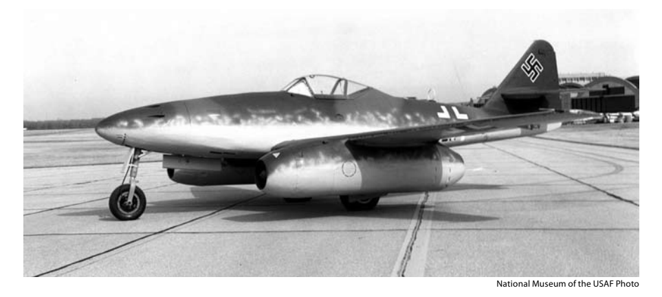
Figure 9. The Messerschmitt 262 was one of the things that made the Luftwaffe a tough nut to crack, but it came too late to reverse the outcomes.

mander for operational purposes though administratively they remain a part of the Army. The original reason for that was that branch's officers rightly feared that the new Air Force would be dominated by pilots, and they desired to remain with the Army.<sup>45</sup> That is far in the past now, and one has not heard an argument for reconsidering that question for many decades.