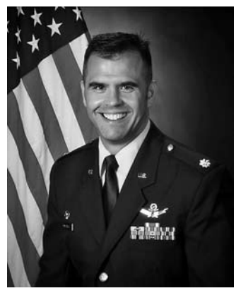
About the Author