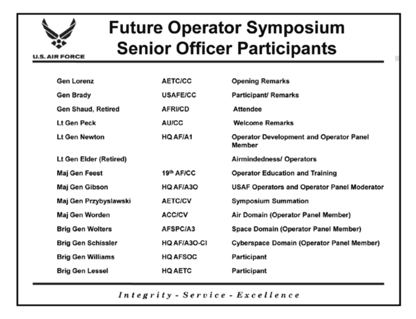
Figure 3. Future operator symposium senior officer participants