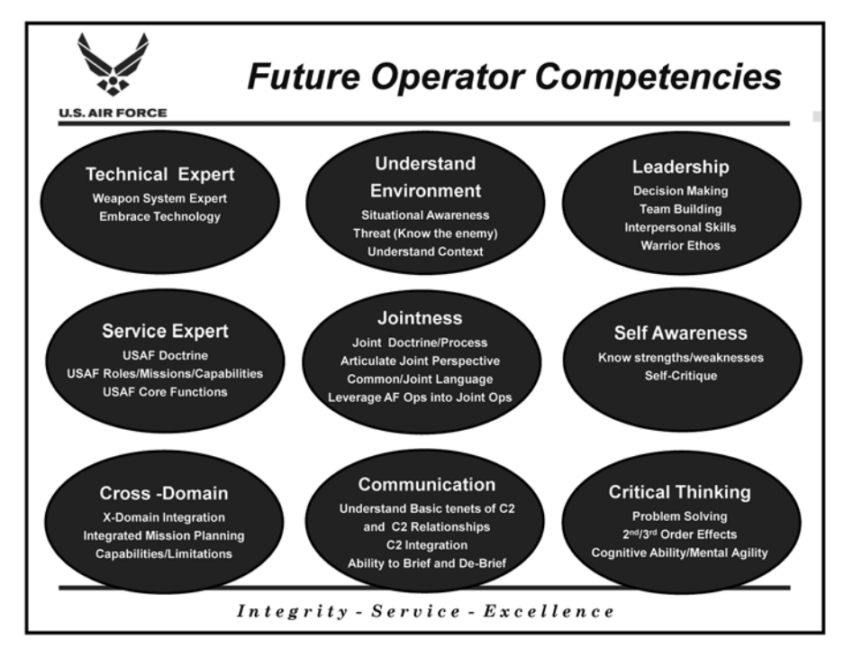
Figure 5. Future operator competencies

several approaches abound regarding how to develop a crossdomain environment. Following is a discussion on the results of the "Future Operator Symposium."