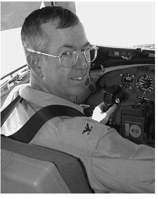
About the Author