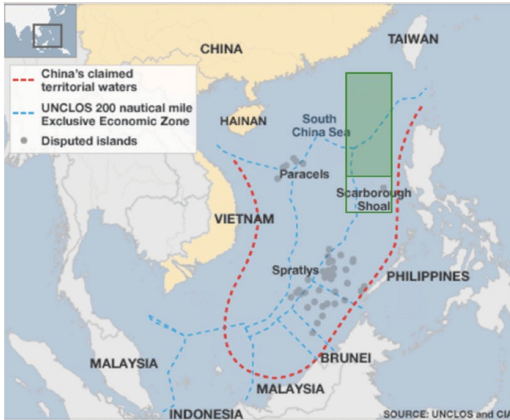
Figure 3.1. A Potential ADIZ in the SCS