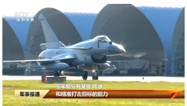
Figure 4: A PLAAF J-10C operating from the previously PLAN-operated Ledong Airfield

It remains unclear whether the PLAAF will retain these newly gained resources in the long-term. Although most of the systems the PLAAF received from the PLAN are relatively modern assets, maintaining upwards of two dozen regiment and brigade-level organizations is not an insignificant commitment in assets and personnel. Some of these systems provide crucial capacity. The previously PLAN-owned air surveillance radar sites provide the only form of ground-based air surveillance in some littoral areas and previously PLAN-operated H-6 bombers allow the PLAAF to commit a larger number of bomber units towards its new nuclear mission without eating into its conventional strike force.