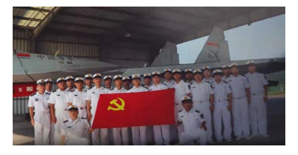
Figure 3: A J-15 parked at Feidong Airfield in 2022

In addition to the improvements to PLA air operations, this realignment supports the PLAN's long-term ambitions to build out a mature carrier-based aviation force. By divesting themselves of thousands of billets, multiple pieces of infrastructure, and numerous airframes, the PLAN is now free to pursue a more carrier-centric force within the constraints of its current level of resourcing. Currently, the PLAN fields two carrier-based fighter brigades and there are indications that PLAN J-15 carrier-based fighters now frequently operate out of one of the PLAN's Feidong Airfield in Eastern Theater Command.