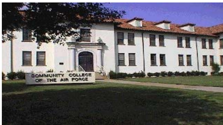
Simler Hall, CCAF Administrative Center Oldest building on Maxwell AFB—constructed in 1928

The administrative staff, located at Maxwell AFB, Alabama, brings together all elements of the system under the matrix authority of Air Force Instruction 36-2304, Community College of the Air Force . The Community College of the Air Force was located at Randolph AFB, Texas, during 1 April 1972-15 January 1977; at Lackland AFB, Texas, during 16 January 1977-31 March 1979; and has resided at Maxwell AFB, Alabama, since 1 April 1979.