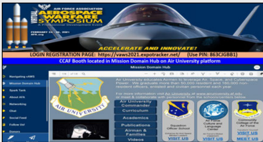
Aerospace Warfare Symposium Homepage