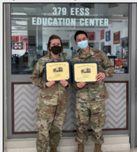
CCAF Advisor Course Graduates