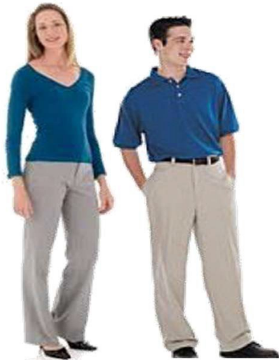
Operational Camouflage Pattern Uniform (OCP)