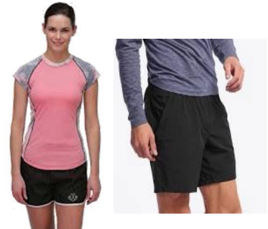
Fitness Uniform (PTUs)

Primed to prevail in competitive environments