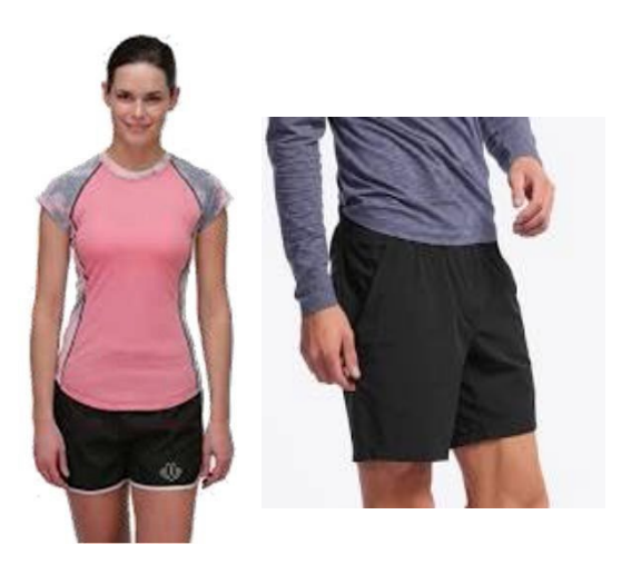
Fitness Uniform (PTUs)