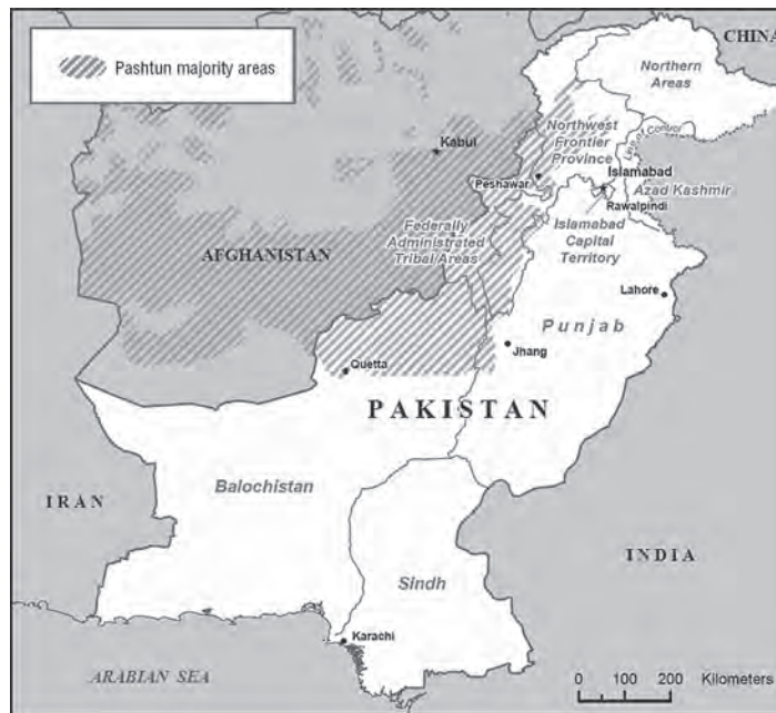
Figure 1: Border areas with insurgency in Pakistan (Reprinted from Thomas H. Johnson and M. Chris Mason, "No Sign until the Burst of Fire—Understanding the Pakistan-Afghanistan Frontier," International Security 32, no. 4 [Spring 2008]: 41–77.)

counterinsurgency missions in the NWFP, a shocking admission that the government had lost control in the border regions. 5 The aftermath of the emergency might be the best indicator of Pakistan's future, because it encapsulates many of the tensions that brought Pakistan to the forefront as a potential failed state.