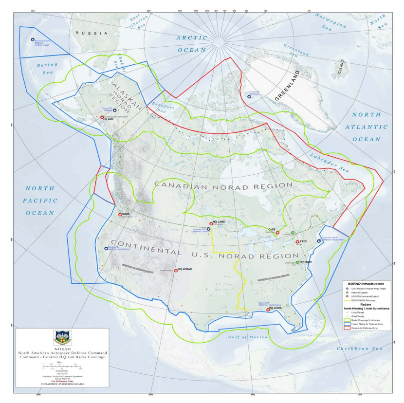
Figure 2. NORAD radar coverage

Third, the detection domains remain largely separate rather than integrated into an all-domain detection and thus analysis structure. While NORAD has air and ballistic missile warning functions, and with the latter, a space-tracking function as well, these appear to be largely independent, reflecting the traditional division between air and outer space. Yet, as the future North American Warning System will likely comprise a significant space-based component, threat detection against these key space-based assets is essential. Moreover, threats to these components also extend to a wide range of space-based assets vital to the military and the economy, especially in low Earth orbit.