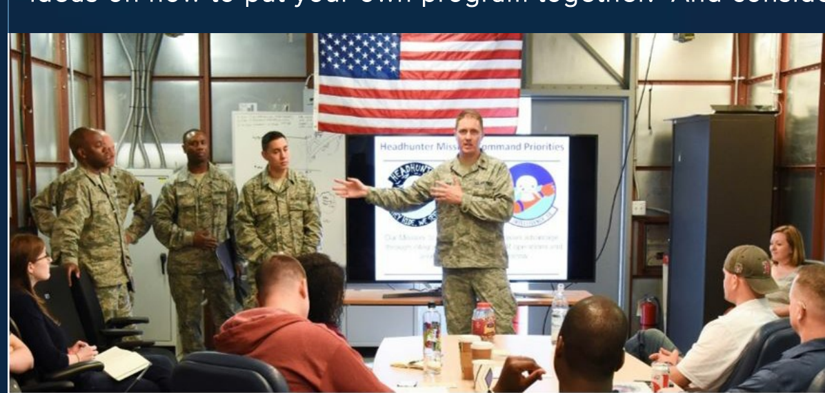
Flight Leadership Course, Ramstein AB, Germany

Visit the community to download FCE experiential lesson plans and lesson guides, plus the Course Director's Guide for ideas on how to put your own program together. And consider incorporating Thinking Routines!